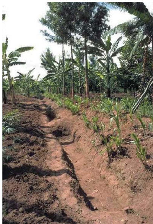
Tied ridges like these can be used to catch runoff, prevent erosion and conserve top soil and soil fertility.